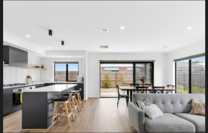
54 OLD ST LEONARDS ROAD, ST. LEONARDS 448.36m 2 | Sold March 2026 | $730,000