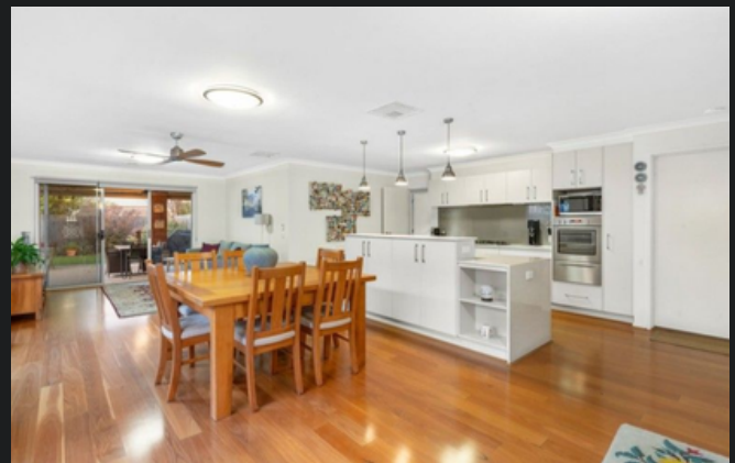
7 WAVE STREET, ST LEONARDS 494.27m 2 | Sold February 2026 | $720,000