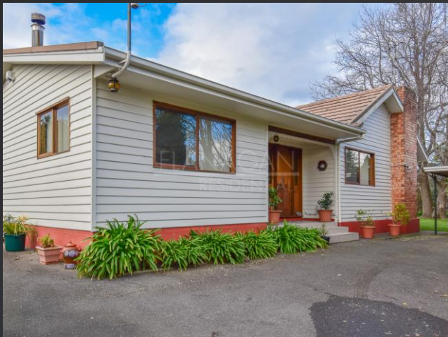
10 Anthony Street, Trevallyn.

Hidden from the street, this 4 bedroom gem is a beautiful family home which offers privacy, a convenient location and most of all value. Situated on a large flat internal block (approx. 1,323 sq m) the property is surrounded by established gardens with a large variety of fruit trees and plants. Immaculately presented, this home offers 4 bedrooms, 2 bathrooms, 2 separate living areas, central modern kitchen / dining area and a laundry. Outside there is a carport, wood shed, garden shed, workshop, extra parking spaces and a private courtyard.