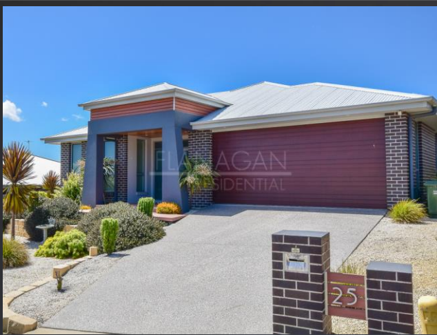
25 Tamar Rise, Riverside.

This sleek, stylish and award winning home offers contemporary easy care living with an exceptional quality fit out. On one level the fantastic floor plan offers 4 bedrooms, 2 bathrooms, 2 separate living areas, open plan dining area which flows to the chef style kitchen, a laundry and double garage. There is a private alfresco outdoor entertaining area to the rear. The property is light and bright and the gardens are easy care. Impressive!