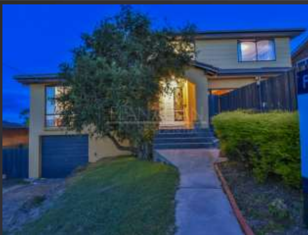
3 Ewart Place, Trevallyn.

If you're in the market for a large home for your growing family, then 3 Ewart Place should be top of your list. Located on a quiet street and close to the Gorge Reserve, it offers 6 bedrooms, 2 bathrooms, 2 separate living areas, modern kitchen, dining room, laundry and a garage with heaps of storage space underneath. The generous block is easy care while there is a patio area to the rear for outdoor family bbqs. Freshly painted inside, it's a bright and light place to call home. This one has value written all over it, so don't delay! Price $345,000.