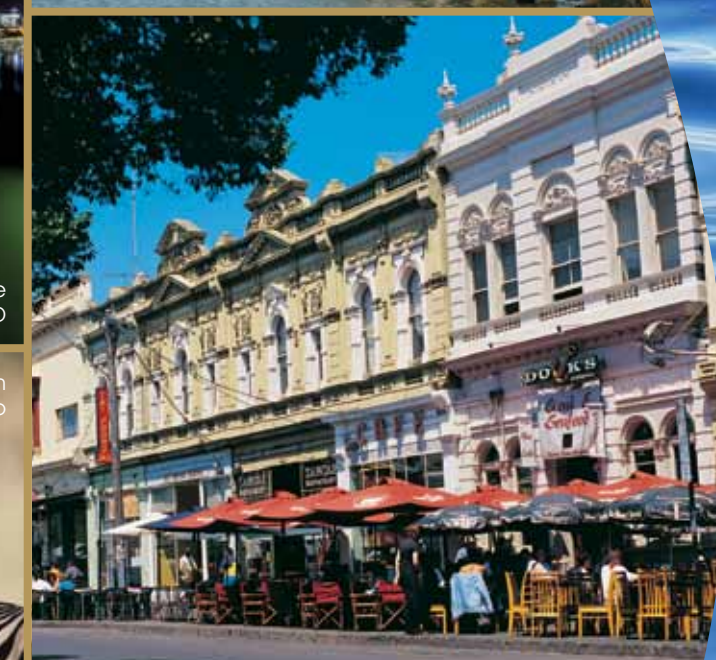
Williamstown Cafe/Restaurant Precinct