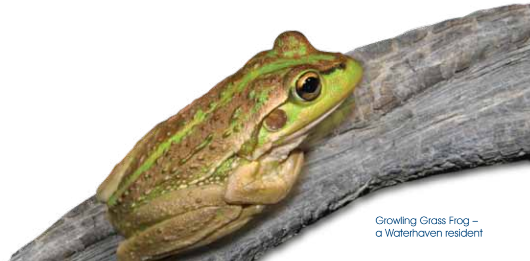
Growling Grass Frog – a Waterhaven resident