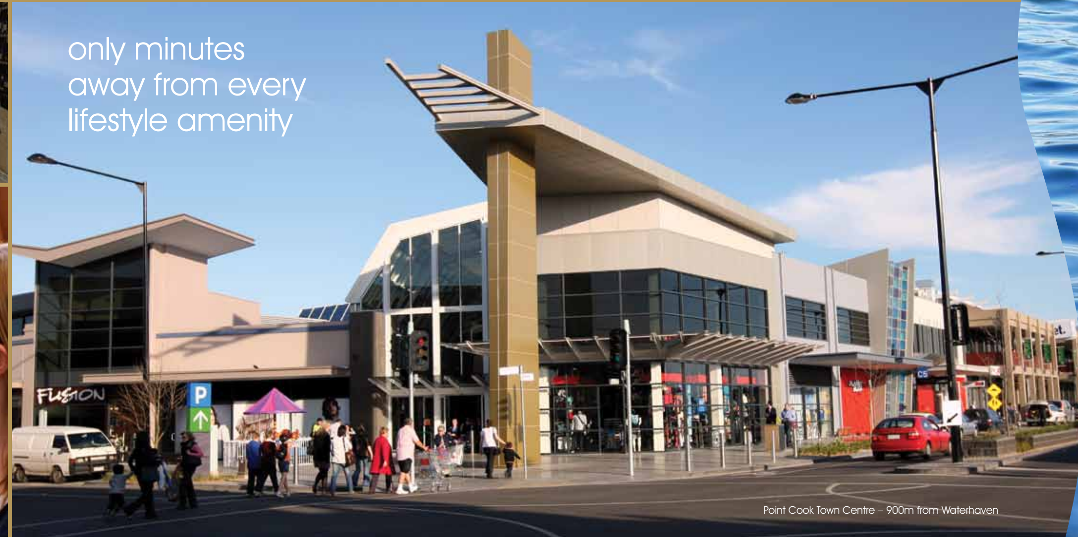
Point Cook Town Centre – 900m from Waterhaven

only minutes away from every lifestyle amenity